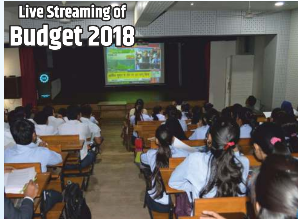
MBA students watching the Live Streaming of Budget 2018