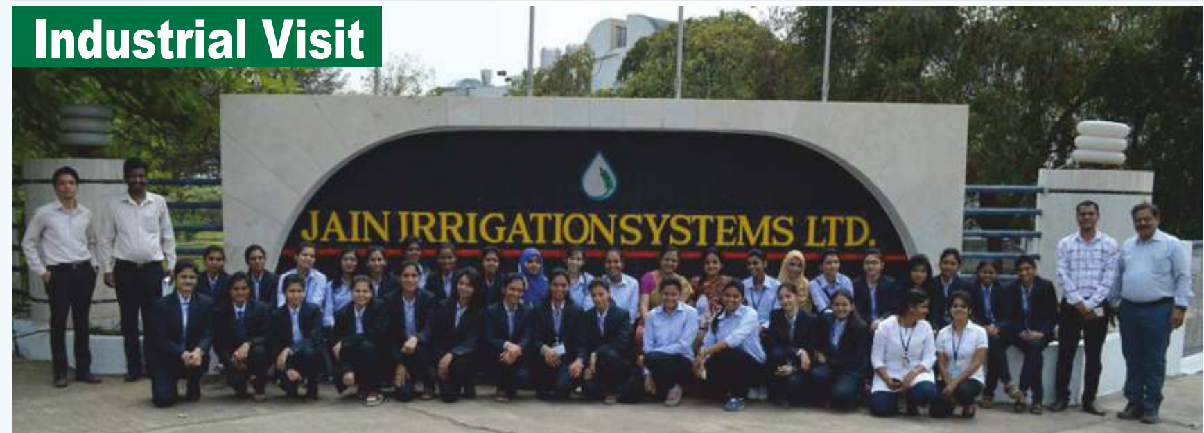
Industrial Visit was organised for our First year MBA students at Jain Irrigation Systems Ltd plastic park on 08 march 2018. The students got insight on the industrial working and culture via this visit.