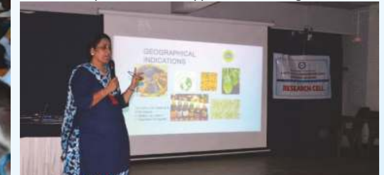
Research cell program