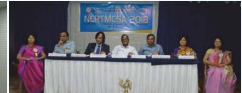
A National Conference on Recent Trends in Management, Computer Science & Applications was organised